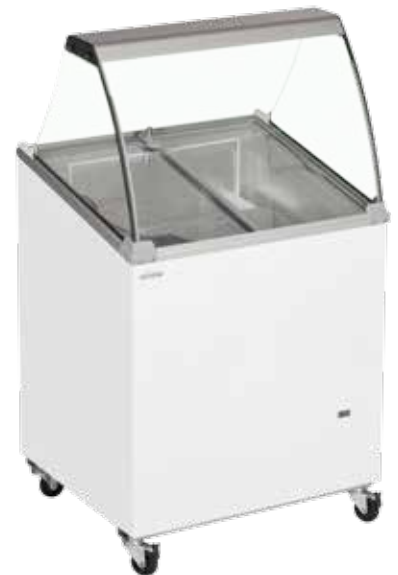
IC200SCE + CANOPY