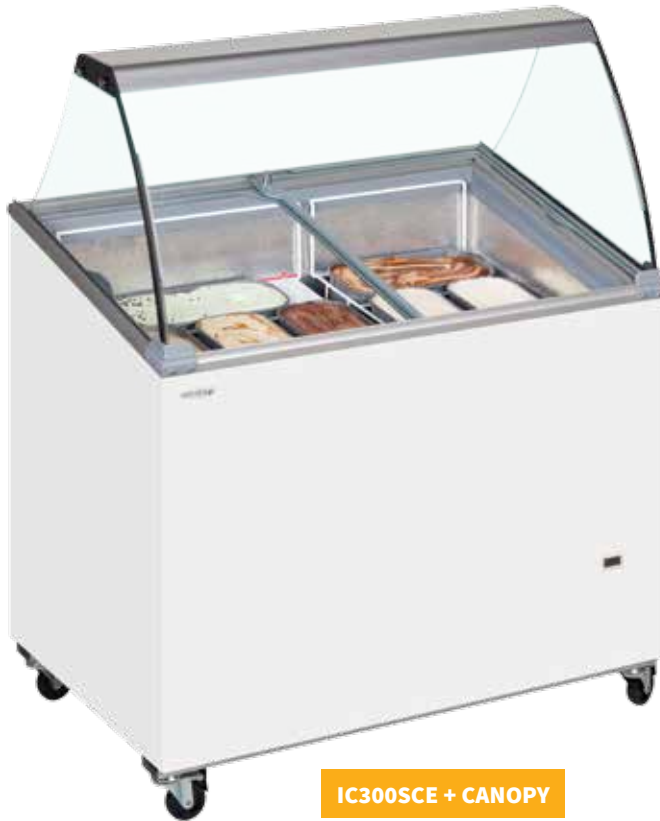
IC300SCE + CANOPY