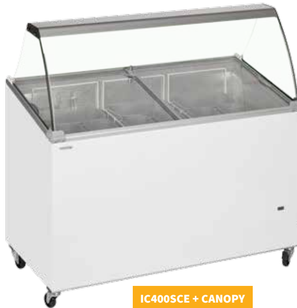
IC400SCE + CANOPY